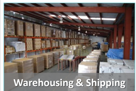
Warehousing & Shipping

DISCLOSURE: This program is supported by DEITAC - Tijuana EDC and the Economic Development Office of the City Of Tijuana - SEDETI. All information included in this profile has been validated by AXIS - Strategic Intelligence Center as a third party independent analyst.