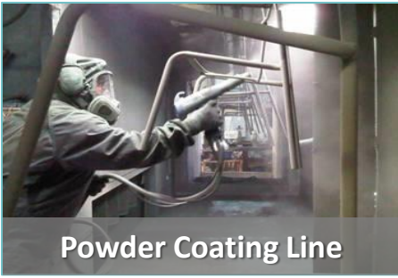
Powder Coating Line