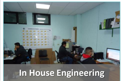
In House Engineering