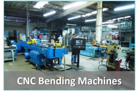
CNC Bending Machines