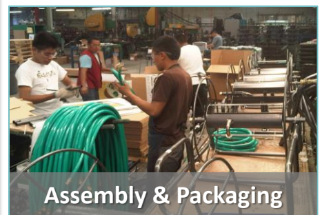
Assembly & Packaging